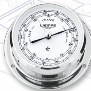
BAROMETER CW090004 B1