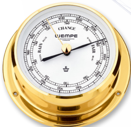
BAROMETER CW070005 B1