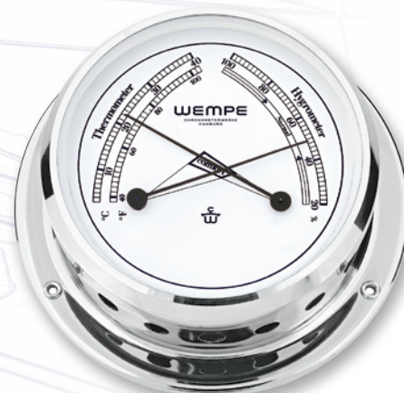
COMFORTMETER CW090005 T1-H2