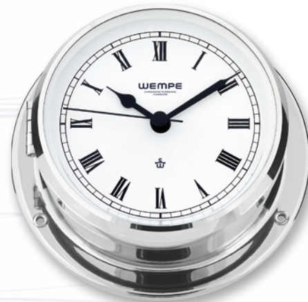
SHIP'S CLOCK CW090002 Q1