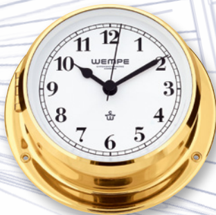
SHIP'S CLOCK CW070003 Q1

This small series with a diameter of just 110 mm is ideal for a ship's cabin. The radio-room ship's clock is equipped with a quartz movement with alarm function. Instruments to predict the weather and to observe the interior climate complete the series.