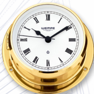
SHIP'S CLOCK CW070002 Q1