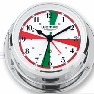
RADIO ROOM CLOCK CW090001 Q3