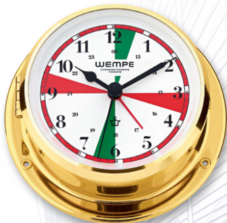
RADIO ROOM CLOCK CW070001 Q3