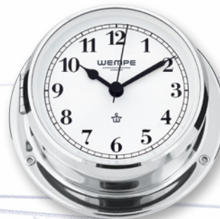
SHIP'S CLOCK CW090003 Q1

Optionally available with a high-gloss brass case coated with colorless lacquer or with a high-gloss chrome-plated brass case.